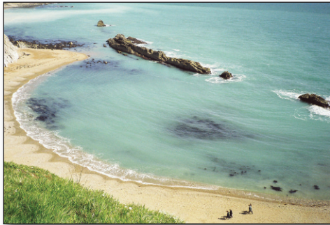
Man o' War Cove.